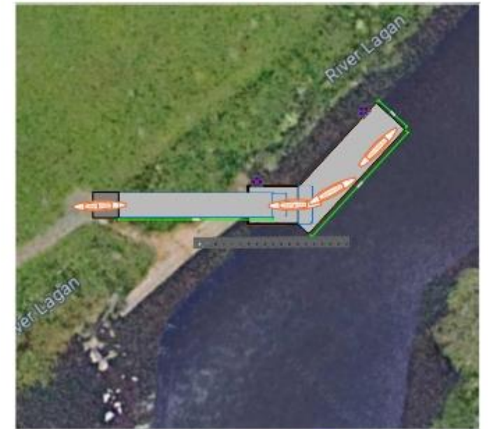
Site 2: Downstream Pontoons